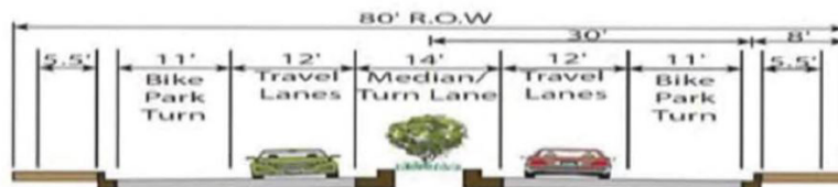
Major Collector (Urban)