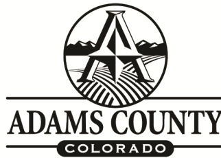
ILLUSTRATION SPECIFICATIONS (See Illustration for Exhibit B as an example):

An illustration shall accompany each property description conforming to the following format: