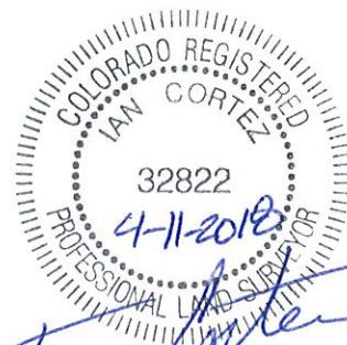
Exhibit "B" attached and hereby made a part thereof.