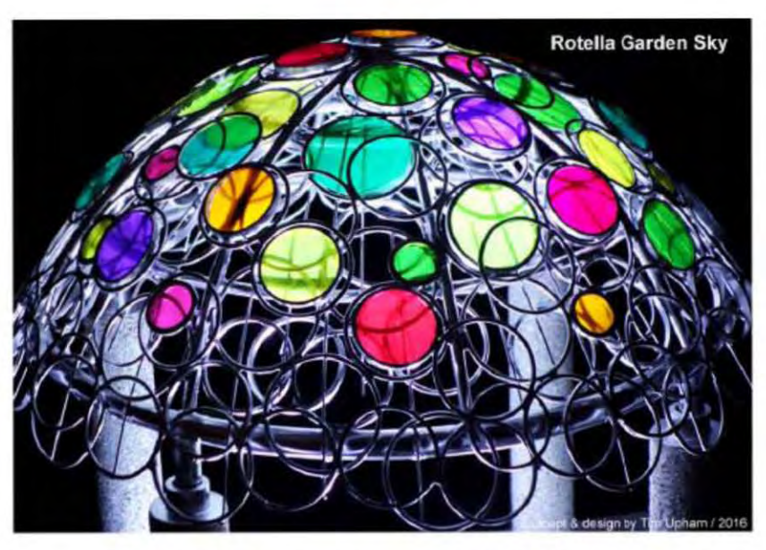
Rotella Garden Sky incorporates the circle motif to visually represent "small wheels & vegetables."

There are 44 colored wheels that range in size from 24" to 12" and are framed by 2" stainless steel flat bar.