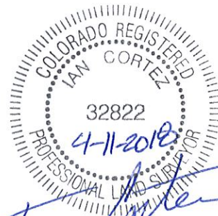
Exhibit "B" attached and hereby made a part thereof.